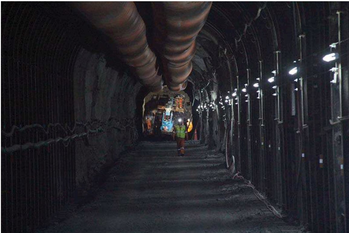
Photo: Ollachea Tunnel